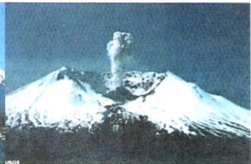
Mt. Saint Helens