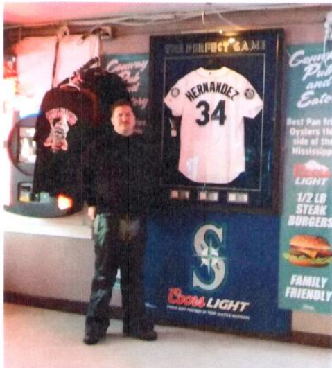
First NSTR Ride of the year to Conway Pub and Eatery